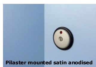
Pilaster mounted satin anodised