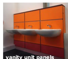
vanity unit panels