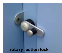
rotary action lock