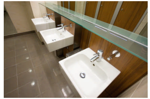
Duravit basins teak effect laminate back panels