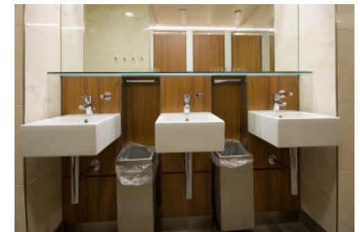
Front elevation of vanity unit

Symetria incorporates flat fronted aluminium pilasters with quality stainless steel ironmongery to provide a classy appearance. Teak effect laminate doors has been combined with glossy white laminate partitions to provide a visual effect in keeping with the building's style. The individual vanity basins are contained within teak laminate columns that provide a contemporary look and the glass vanity unit and support frame is from a range supplied by Geberit