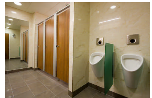
Symetria cubicle system with stainless steel hardware