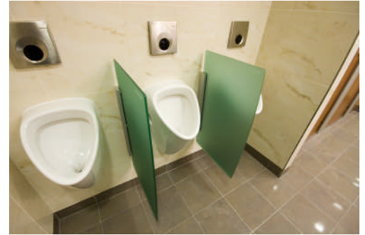
Glass modesty screens and support frame by Geberit