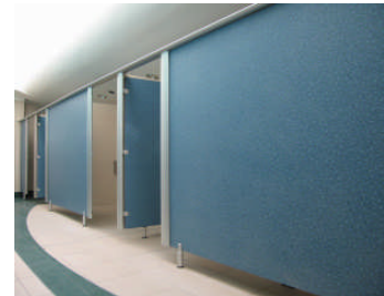
Mother and baby toilets