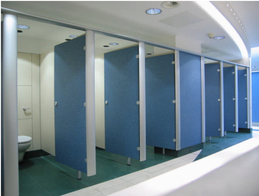
Decra Streamline cubicle system as installed at the Glades shopping mall