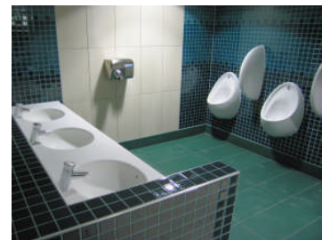
Male area with urinals