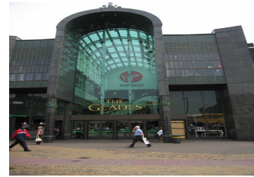
Glades shopping mall Bromley

Architects the Tooley Foster Pshp chose the Decra Streamline cubicle system for this well known shopping centre in Kent. Elliptical aluminium pilasters combined are with durable solid grade laminate panels and saa ironmongery. The speckle blue colour contrasts well with the white Corian vanity unit- which includes a child height section. Solid grade laminate duct panels are cut in a grid shape to resemble the appearance of tiles. For more details contact Decra sales department.