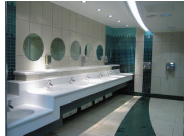
Corian vanity top with child height section