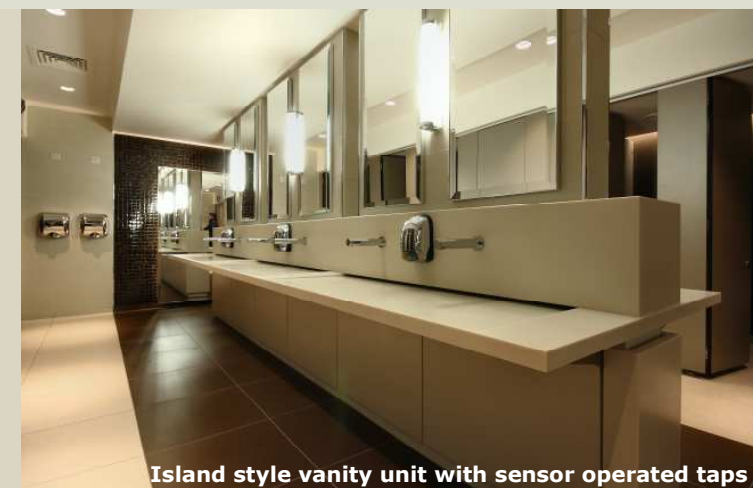
Island style vanity unit with sensor operated taps