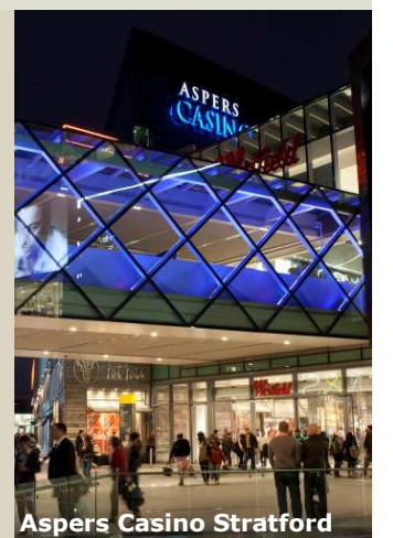
Aspers Casino Stratford