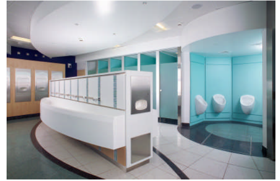
Levada trough vanity unit