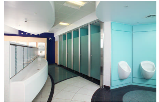
Faceted urinal duct panelling