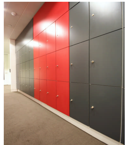
Assa locks as standard