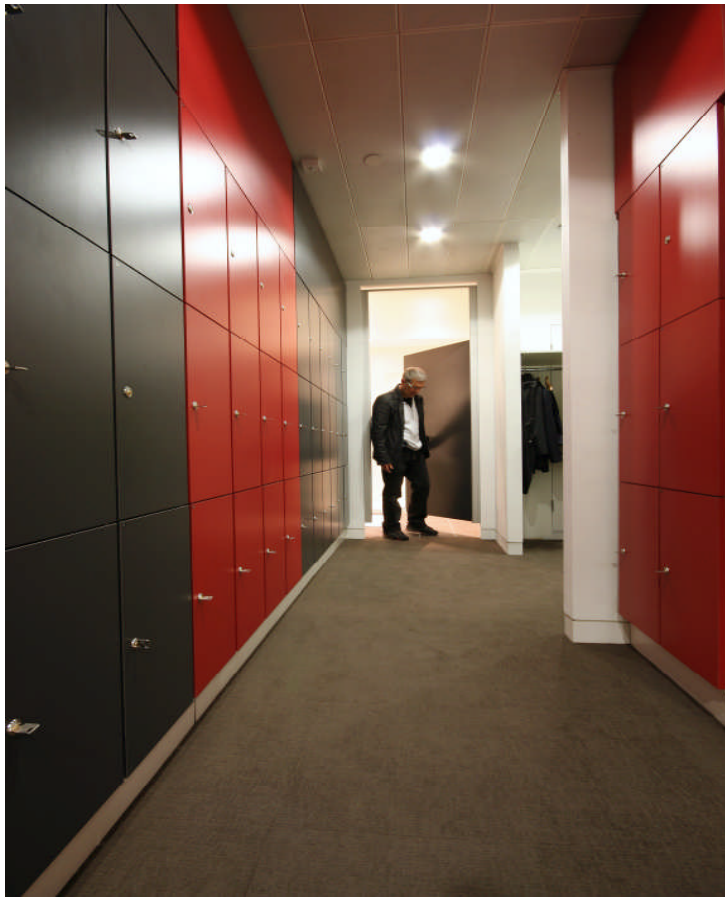
Decra Reflex L locker system as installed at 50 Old Bailey London-- offices for Dyer Associates architects