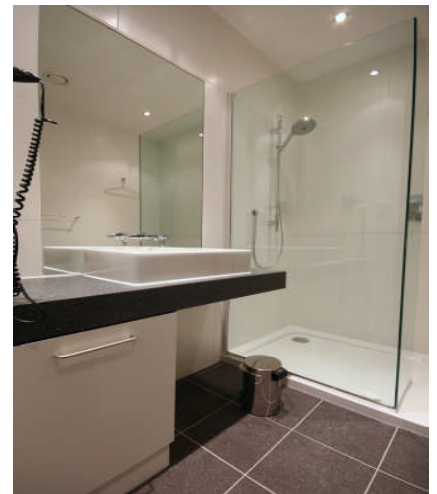
Shower room with solid surface vanity unit

Architects— Denton Associates chose the Decra Reflex L laminate locker system for new offices for their client Candover in London’s Old Bailey. 20mm thick doors comprising of laminate bonded onto particleboard and edged in the same laminate are combined with 19mm melamine faced chipboard carcass to provide an inexpensive but extremely flexible locker solution. As the structure is made to order we can achieve various lay outs to suit the area. We like the use of the 2 colours here to give a contemporary appearance and to break up the monotony of using just a single colour. Contact the sales dept for details.