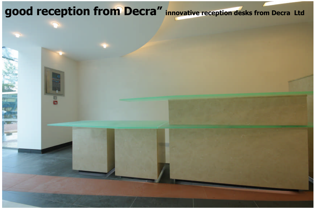
20mm Perspex Glacier Green and stone reception desk unit London Road Reigate, Surrey