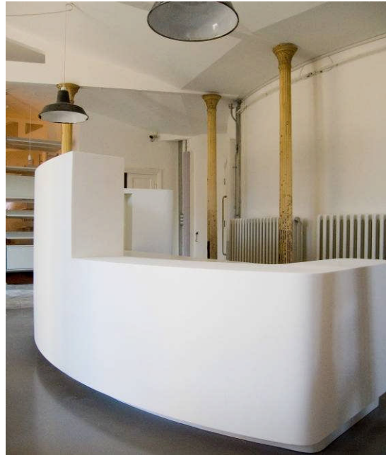
Curved solid surface unit - Art Centre - Prince of Wales Drive Chalk Farm