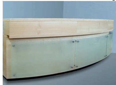
Far left and middle curved Corian desk unit - Cambridge University. Left Maple and glass unit - Thames Barrier visitor centre.