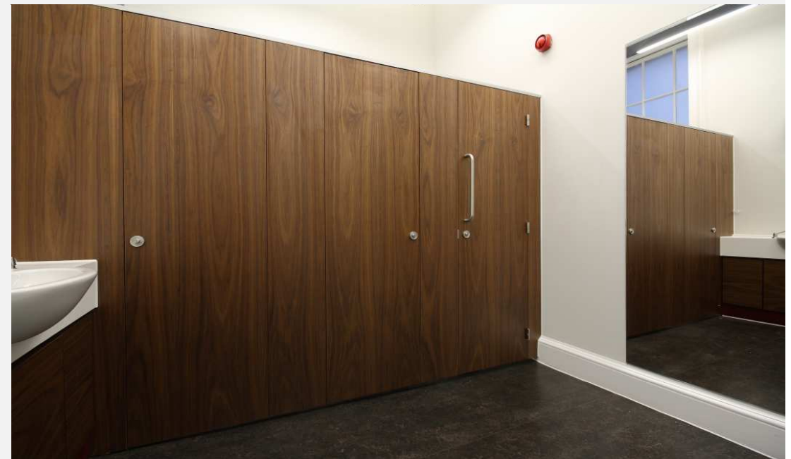
Decra Chicane cubicle system in walnut veneer and wine red solid grade laminate Stratum in Ivory laminate