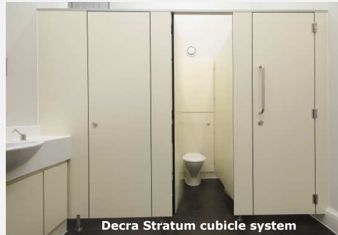
Decra Stratum cubicle system