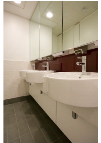
Solid surfacing vanity top, semi recessed basins