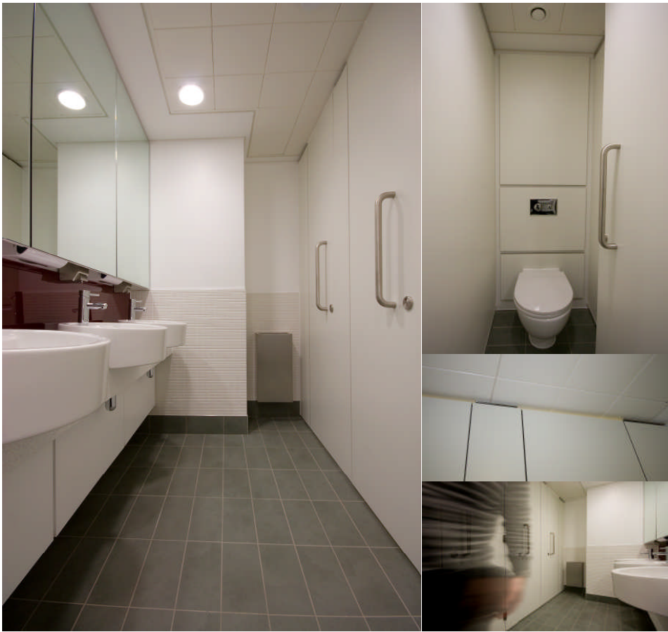
164 Shaftesbury Avenue; April 08 Decra Burj 20mm cubicle system