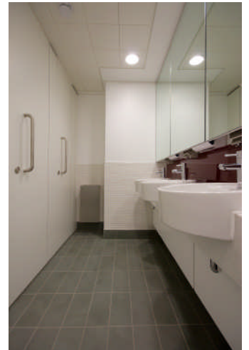
Doors have s/steel pull handles as design detail