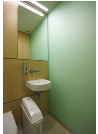
Eagle House, 110 Jermyn Street, London SW1 - 2nd floor ladies washroom