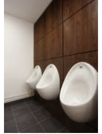
Walnut urinal panels