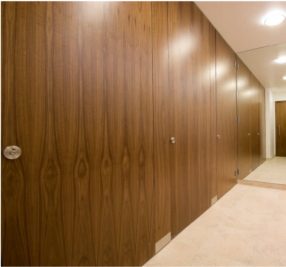
Offices Cavendish Square Decra Burj cubicle concept in real wood walnut veneer laminate