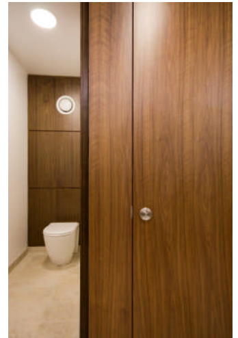
Rebated hardwood edge stained to match fascia