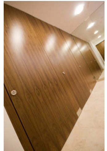
Quality stainless steel DDA compliant hardware