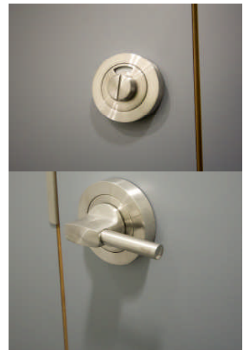
New German designed s/steel hardware