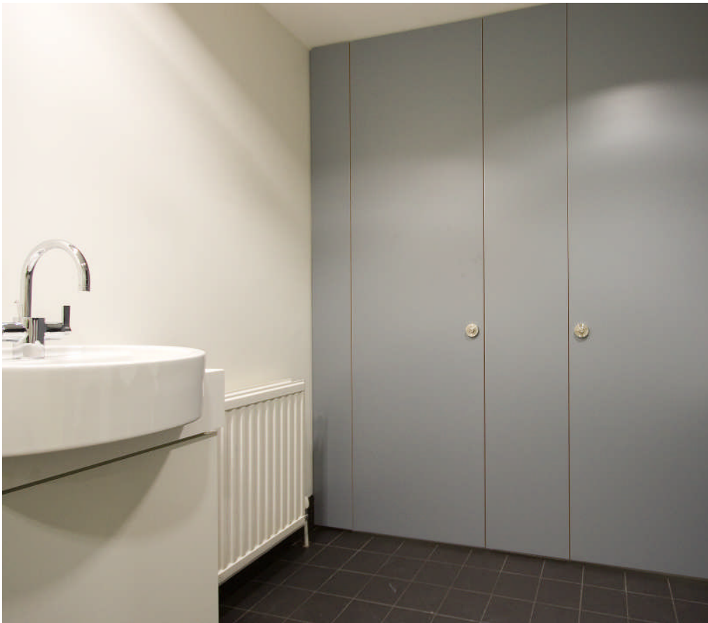
Albion House London SE1, Decra Burj 38mm flush fascia cubicles in plain grey, April 08