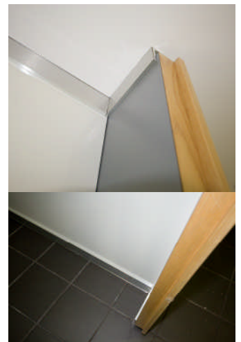
Extruded aluminium interface sections