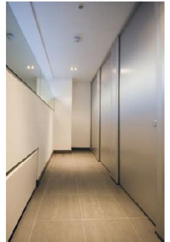
Decra Barbarian unisex cubicle system